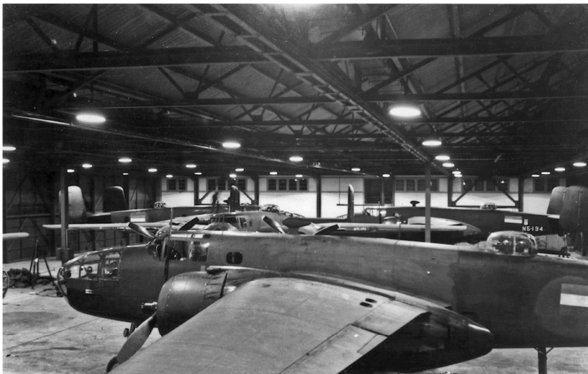
The five B-25Cs initially assigned to 18 Squadron NEI in the squadron hangar at Canberra during April or May 1942 with in the back aircraft 41-12464/N5-134 and with its nose to the camera aircraft 41-12501/N5-161