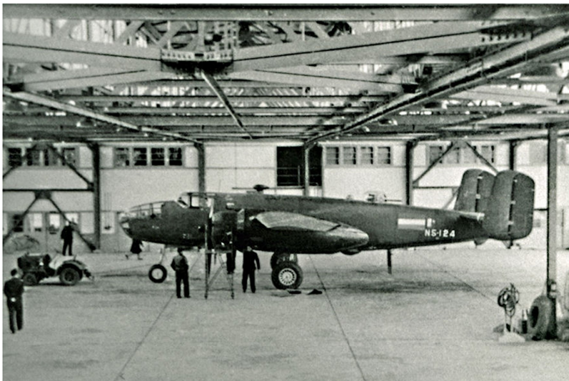
B-25C No N5-124 (ex N5-136) photographed in the hangar of 18 NEI Squadron at Canberra around July 1942 (collection G.J. Casius)

The protests along diplomatic channels worked and eventually the Chief of Staff of General MacArthur informed the NEI Headquarters in Melbourne in a carefully drafted letter dated 14 June 1942 that eighteen B-25s were to be delivered. The project was called Project Mark I and re-equipment of 18 Squadron with eighteen B-25C and B-25D aircraft not belonging to the original NEI Defence Aid assignment should start in July 1942. The five aircraft assigned to 18 Sq NEI were to be returned to the USAAF. The USAAF suddenly showed good will and transferred a sixth B-25 (the repaired 41-12494 becoming N5-127) which arrived at Canberra around 21 June 1942. This aircraft was possibly an exchange for the salvaged 41-12476. [51] During August 1942 the first of the new B-25s (registered N5-128 up to and including N5-145) were finally received. Although these aircraft were equipped with the rather rudimentary D3A Estoppey bombsight, replaced by the ML on its B-10 bombers in 1937 already, 18 Squadron NEI soon became a very efficient medium-bomber unit operating in the Darwin area under operational control of the RAAF. Former NEI B-25s were put to good use some months earlier. The 3rd Bombardment Group (Light) flew B-25 operations from 5 April 1942 but suffered severe losses. [52]