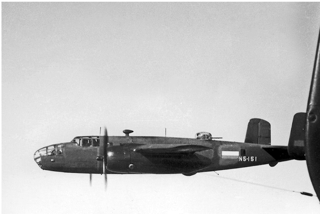
Mitchell No 41-12482/N5-151 was received at Archerfield on 29 March 1942. The photograph was taken in April or May 1942 during a training flight from Canberra

Of the remaining three B-25s one crashed in Africa (to be paid for by the NPC) and two were damaged at Palm Beach West (to be repaired at the cost of the NPC)