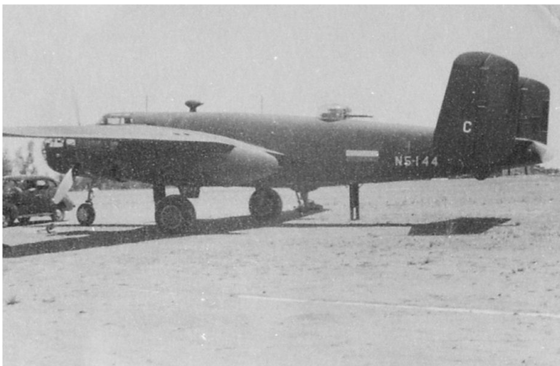
B-25C No N5-144 "C" of the ML Detachment Bangalore photographed at Bangalore in April 1942. The airplane carries the new style "flag" national marking painted on the aircraft during the post ferry inspection by the Hindustan Aircraft Factory at Bangalore

The South Atlantic ferry route and central Africa route to British India and Russia started at Municipal Field, Miami (Florida). Miami was too busy to act as a collection point and Air Corps Ferrying Command crews consequently flew the B-25s from Long Beach or Memphis to Morrison Field, West Palm Beach. At this field the USAAF could support the ferry operation with a materiel squadron for first and second line maintenance and with a sub depot for third and fourth line maintenance. [21] The first B-25 was flown to West Palm Beach on 9 February 1942. The first six aeroplanes that got their final flight checks at Miami were all NEI aircraft, but these were to be followed by mixed batches of B-25s meant for both Russia and the NEI. [22] Only six of the ML aircraft left Miami, however, as two were damaged in a ground collision at West Palm Beach on 22 February and all others collected at Morrison Field were redirected to Sacramento. [23] The first B-25 left for British India on 26 February 1942, another two the next day and the sixth and last took off from Miami on 1 March 1942. Some B-25s of the next group of six aircraft were scheduled to leave on the next day but one had a malfunctioning engine and departure was postponed for a day. [24]