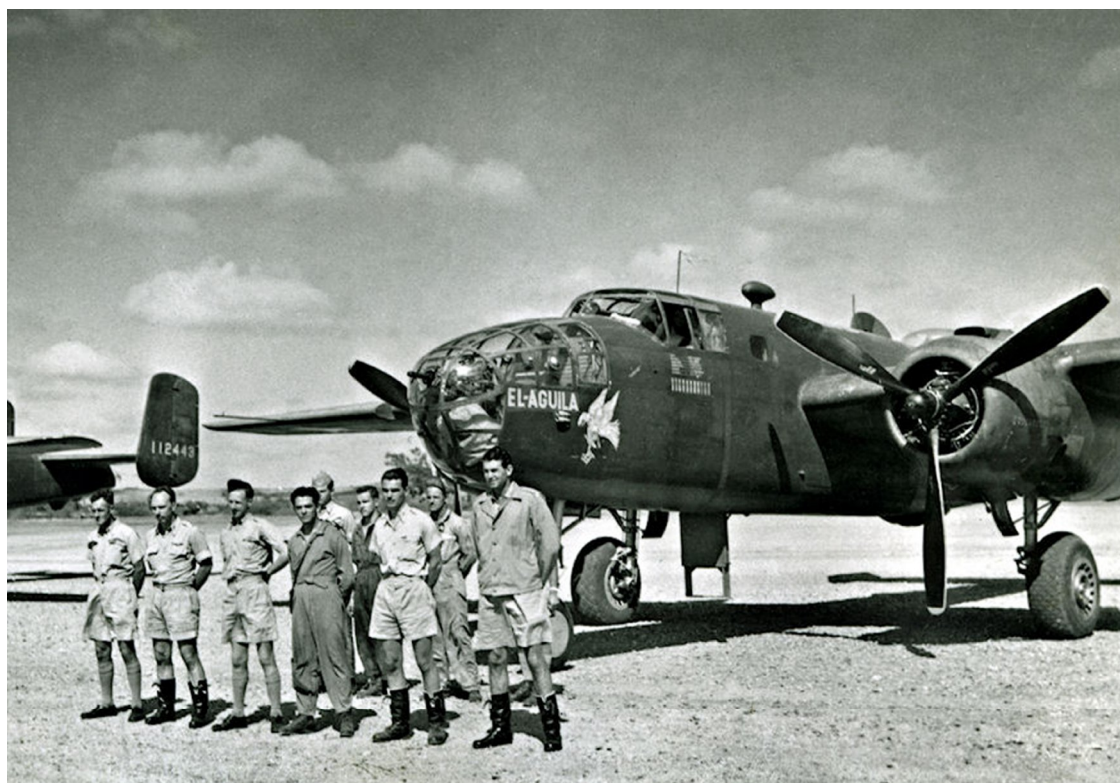
Former ML B-25Cs with USAAF crews and servicing personnel of the 3 rd Bomb Group (Light) at Charters Towers (official USAAF photograph)

Brett received orders from the Commanding-General USAAF on 26 March 1942 that of 23 B-25s that had left the U.S. for Australia eighteen were to be reserved for the NEI. [38] Most of these 23 aircraft were already at Archerfield, however, of which 12 were on loan to Brett. Van Oyen informed the NPC, through the Dutch military attaché in Washington, that same day that he had agreed to release 36 of 54 B-25s to be delivered in Australia to the USAAF at the urgent request of Brett. [39] Brett informed his superiors in Washington about the details of the “understanding” with Van Oyen and reported on 28 March that he already had taken over twelve B-25s from the Dutch. [40] Van Oyen, by then, had agreed to deliver an additional six B-25s, before completing the eighteen needed for the NEI squadron. [41] Of the B-25s that arrived in the period of 28 March up to and including 2 April three were now added to the loan to Brett, aircraft involved being: 41-12441, 41-12443 and 41-12480.