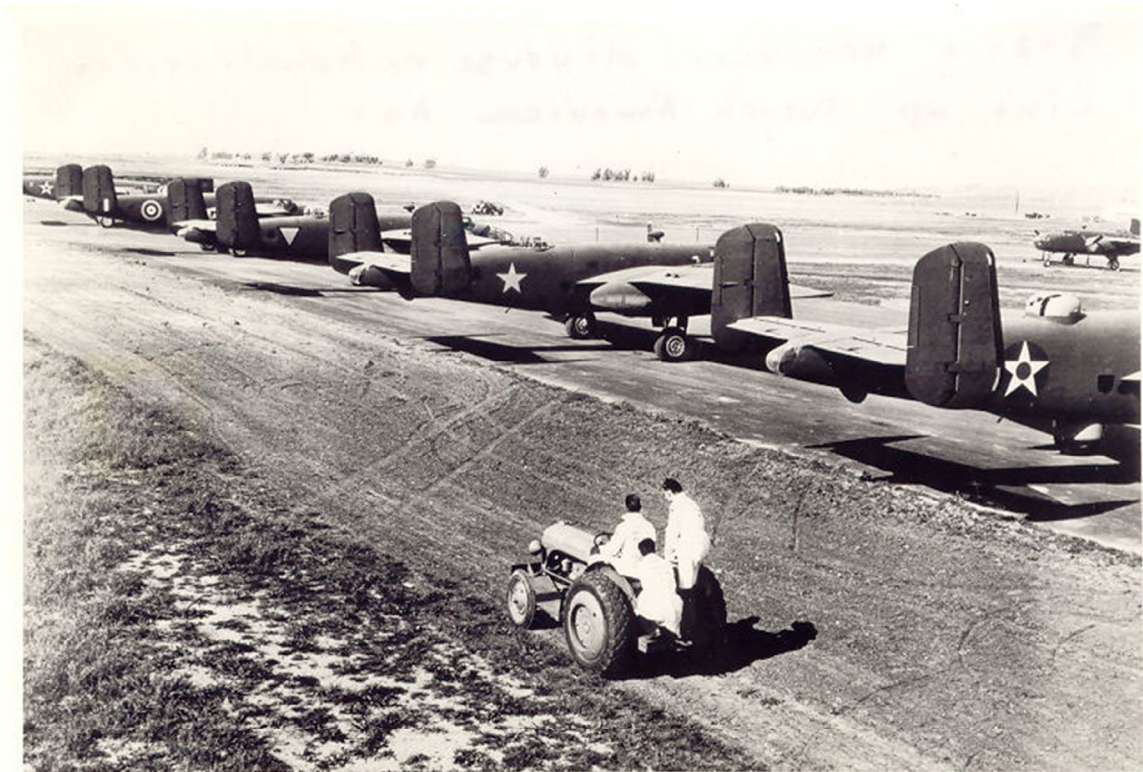
Publicity shot of the flight line of the Chicago & Southern Airlines Modification Center, showing B-25s for the USAAF, NEI, Russia and Great Britain. The censor has removed the Air Corps serials on the tails of the aircraft

All of the (priority) deliveries of B-25C and C-5 aircraft against the original contract were cancelled, with none delivered to the ML yet, during the second half of March 1942. This was a purely administrative matter as Materiel Command USAAF introduced a new system of allocations per production block from 1 April. Allocations of new production aircraft were now to be done by the Munitions Assignment Board, MAB, an advisory body to the Combined Chiefs of Staff. This board quickly reassigned to the NEI 101 B-25Cs (following the original delivery schedule but deleting the thirteen aircraft of March) and added one extra B-25D. These new assignments were later reduced, cancelled and replaced by other assignments several times. For the year 1942, eventually, only ten (still NEI owned on paper) B-25C-5 aircraft were assigned and delivered to the NEI for use at the Royal Netherlands Military Flying School at Jackson (Mississippi). At the time of the policy change nearly all the NEI-DA B-25Cs were already delivered by NAA, however. [5]