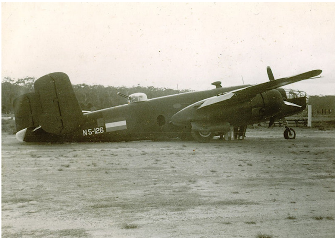
Aircraft No N5-126 (formerly N5-161) of 18 NEI Squadron after a crash on Moruya airstrip on 21 July 1942

Summarising the above, the USAAF took over from the ML “on loan”, that is the aircraft to be replaced from new deliveries at a later date, 17 B-25s during March and April 1942. One of these 17 B-25s was, however, considered a write off at the expense of the USAAF.