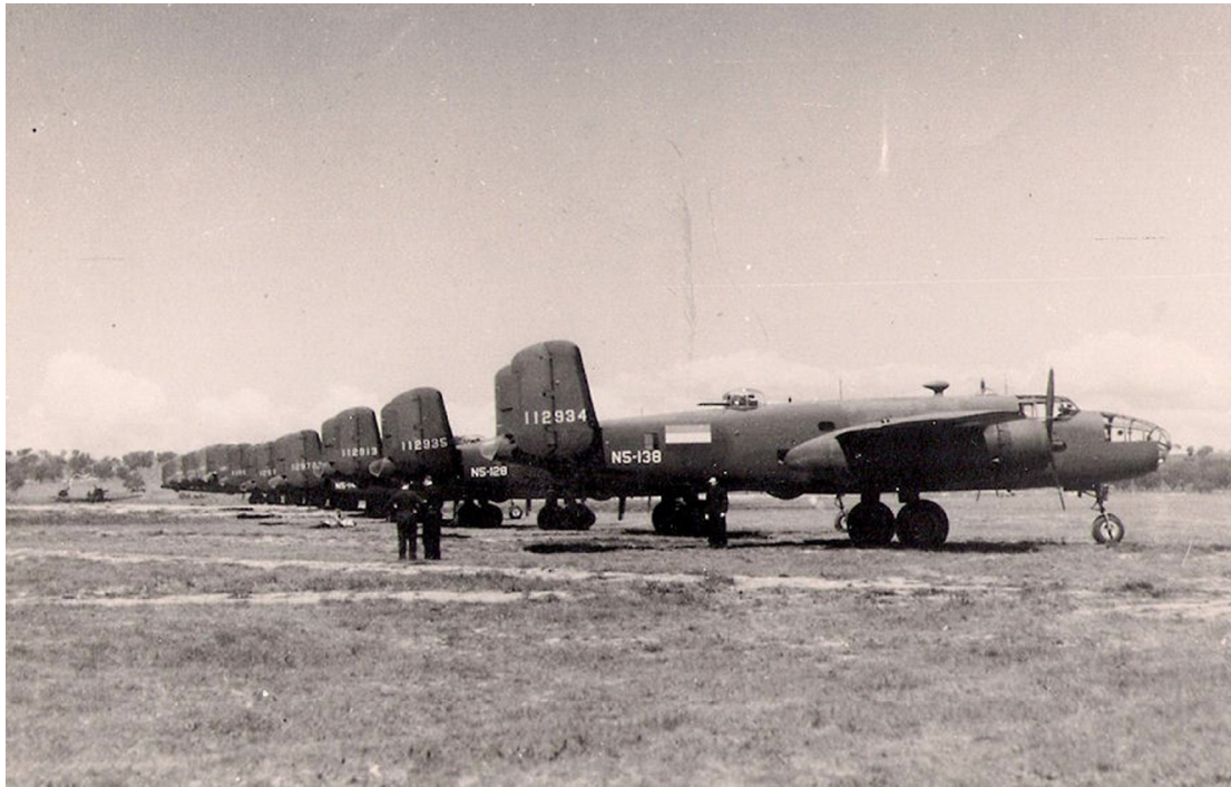
Project Mark I Mitchells of 18 Squadron NEI at Canberra during September 1942