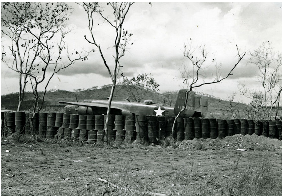
Former ML Mitchell No 41-12485 of 3 BG (L) photographed at Port Moresby around January 1943

Groups of personnel of 3 BG arrived at Archerfield on 25 March, 27 March and 1 April and took over the 12 B-25 initially transferred, followed by the three that arrived in the period of 28 March up to and inclusive 2 April. Personnel of the Air Depot painted American insignia on the B-25s and painted out the N5 serials of the ML. Jack Fox gave a briefing on the B-25 and its systems and after studying the Technical Orders and check outs by ML personnel the 3 BG crews, mostly trained on Douglas A-20 light bombers in the US but including some former Douglas A-24 single engine pilots (however, with some twin-engine experience), left for their base Charters Towers near Townsville. Departure was on 29 March, 30 March and 3 April 1942, with a total of 15 aircraft.