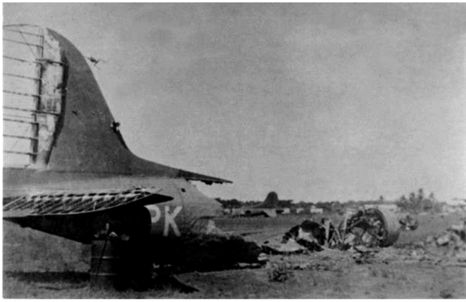
Wreckage of the Douglas DC-3 PK-ALO at Broome.

The aircraft that had flown to Broome arrived there in the middle of a Japanese air raid carried out by Navy O fighter aircraft coming from Timor.