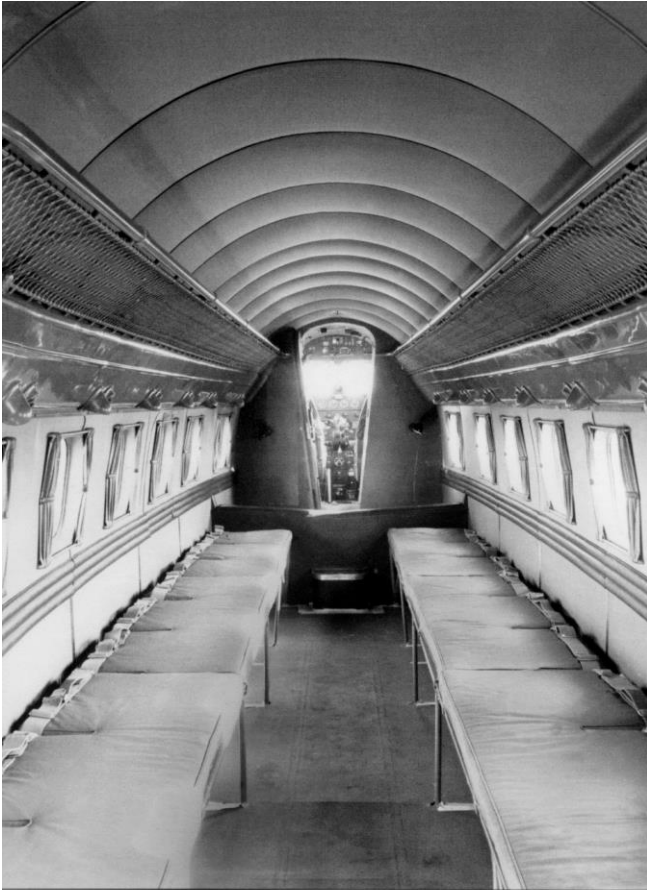
The spartan interior of a Lodestar fitted out for troop transport with bench seats on both sides of the cabin. This particular aircraft was for the Netherlands East Indies.

Depot of the Technische Dienst (Technical Service, TD) of the ML at Andir. Anything that could save weight and was not strictly necessary had been stripped from the cabin, including the parachutist seats along the sides of the fuselage.