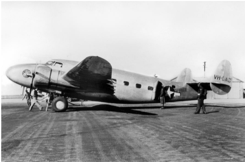
Former LT909 of the D.VI.A. when serving as a so-called DAT Pool aircraft with Guinea Airways in Australia in 1943 (Gordon Birkett, RAAFWA collection).

The Lodestars had played an extremely important role during the war period and had been used exceptionally intensively. As a result the crews made an enormous number of flying hours and the pilots and aviation wireless operators who had been assigned from December 1941 up to and including March 1942 flew between 350 and 450 hours in this period,