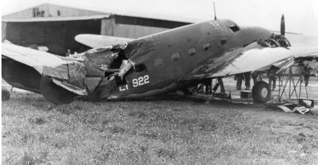
Wreck of the LT922 at Archerfield late February 1942. ML and USAAF personnel are busy taking off the engines to transfer these to aircraft LT919.