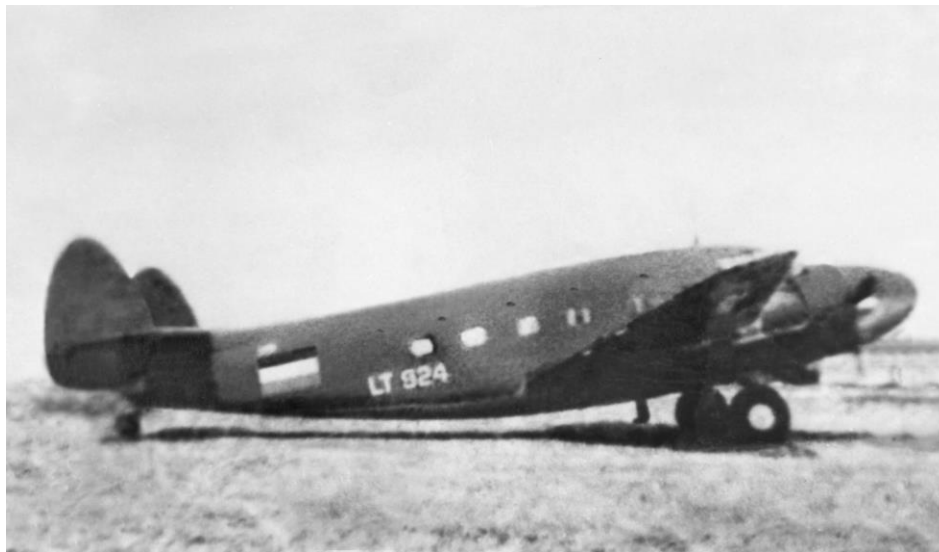
Lodestar LT924 flown by Res Tlt Winckel photographed at Port Hedland on its way to the Boeabatoeweg for the final evacuation flight.

The assignment of passengers over the (now) four transport planes, however, was adjusted. The LT924 was the last transport plane to leave the Boeabatoeweg on 7 March at 03:00 hrs, with as passengers seven civil servants, the ML officers Res Elt H.H.J. Simons (a fighter pilot) and navigator-bombardier Res Elt K. Akkerman (both unmarried and like